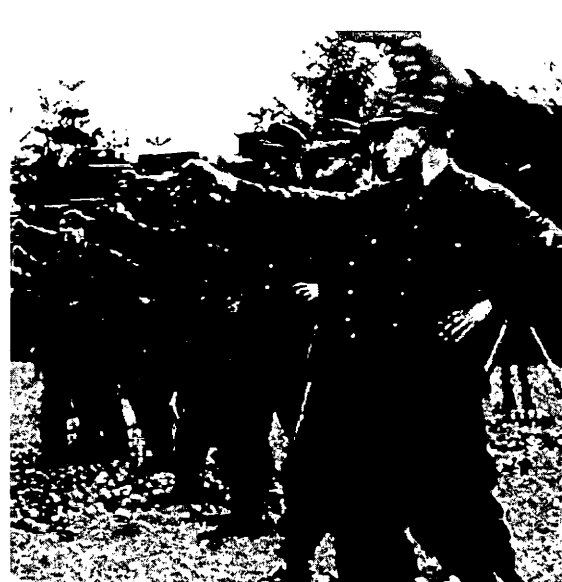
Nazi political warfare in the East. TOP: A cavalry unit of Vlasov's Army on patrol on the eastern front. CENTER: Latvian SS volunteers during a training drill, 1944. BOTTOM LEFT: SS photograph of three generations of Jewish women, seconds before they were murdered. The armed men in the background are Latvian police volunteers. BOTTOM RIGHT: Suspected anti-Nazi partisans were hanged by Latvian collaborators in Minsk as a warning to the population.