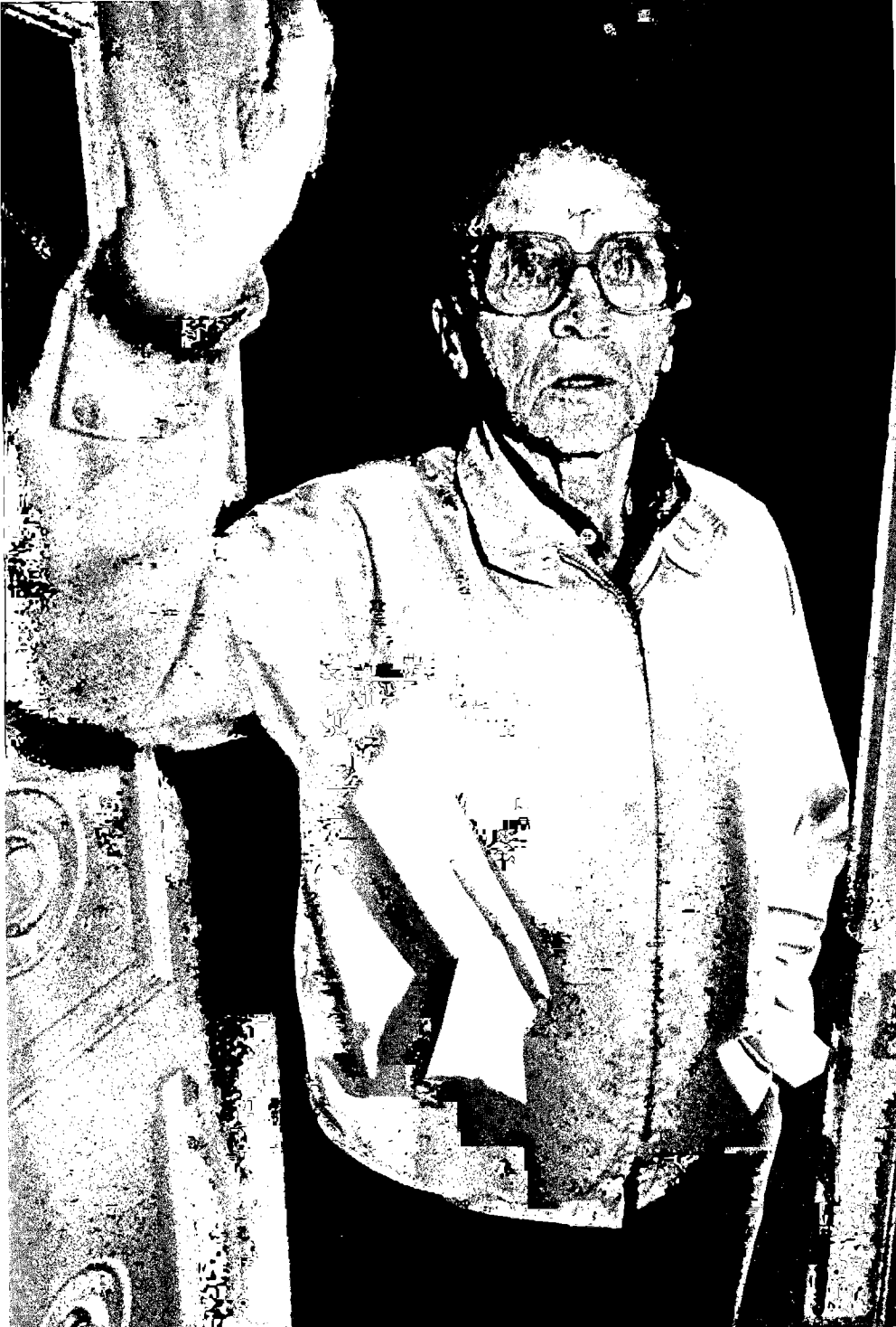
Ukrainian extreme nationalist leader Mykola Lebed. Despite Lebed's record as a convicted assassin and security chief in Nazi-occupied Lvov during a 1942 pogrom, the CIA brought him to the United States in October 1949, then intervened to squelch an Immigration and Naturalization Service investigation when word of his background leaked.