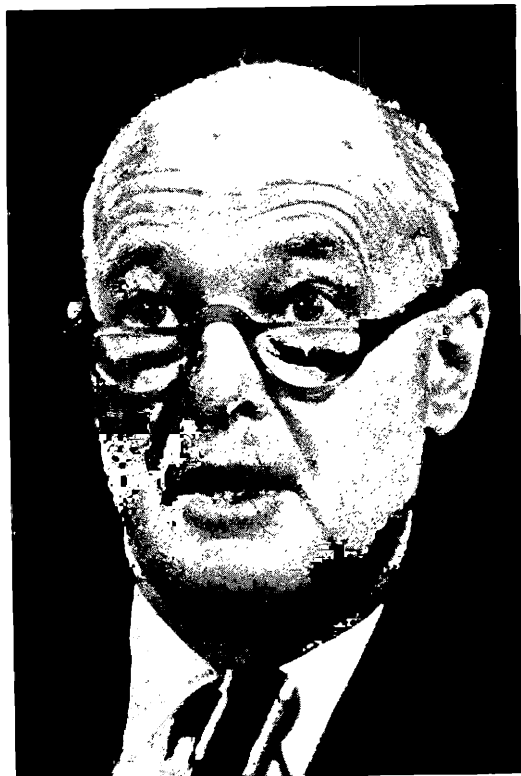
George F. Kennan. As director of the State Department's Policy Planning Staff during the late 1940s, Kennan played an influential role in the development of early U.S. clandestine operations, including recruitment of Nazi collaborators believed to be useful for intelligence and psychological warfare. TOP: Kennan as a young Foreign Service officer in 1938. His service at the U.S. Embassy in Moscow established lifelong friendships with some of America's—and Nazi Germany's—most prominent experts on the USSR.