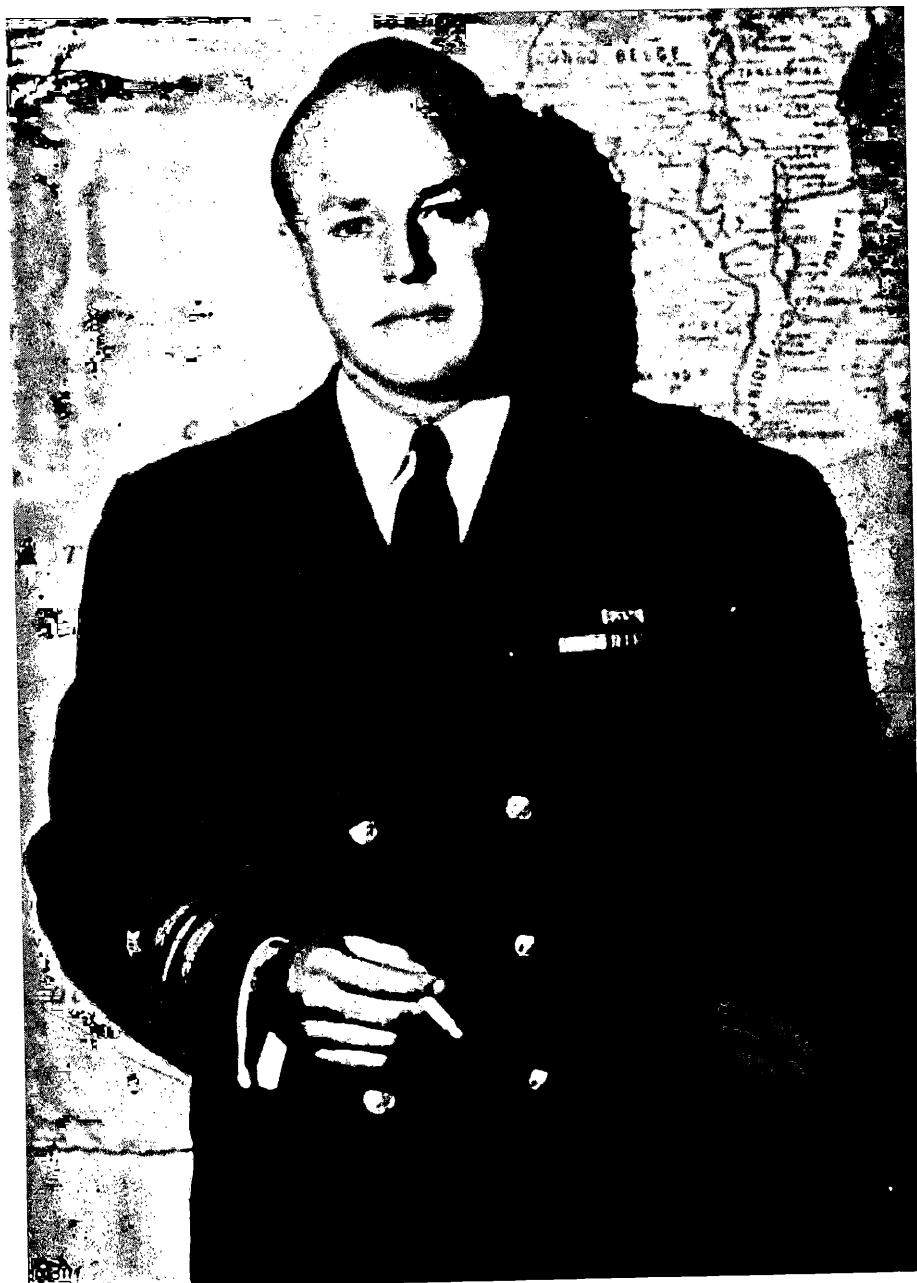
America's first chief of clandestine operations Frank Wisner, shown here in a rare photograph as an OSS officer in 1945. Wisner's Office for Policy Coordination and, later, Plans Directorate of the CIA became the headquarters for covert warfare employing Nazi collaborators.