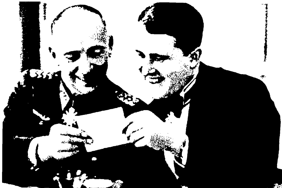
TOP: Nazi Germany's wartime rocket chief Walter Dornberger (left), seen here with Wernher von Braun in 1944. Dornberger set the schedule by which 20,000 inmates at the Nordhausen concentration camp were worked to death. BOTTOM LEFT: Nordhausen camp shortly after liberation by U.S. troops in April 1945. BOTTOM RIGHT: Dornberger entered the United States under Project Paperclip and eventually emerged as a senior executive of the Bell Aerosystems Division of Textron. The photo here is from 1954.