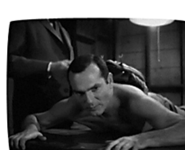
Scene from “The Invisibles”

In the February 3 episode “The Invisibles,” invisible aliens performed surgical experiments on humans who, like Barney Hill, were lying face down on a table. In “The Invisibles” a crab-like alien monster with a long, tube-like tail is placed on a supine human’s back, and the tail enters the human’s back to inject an invisible parasite. Hill’s anal probe is a reasonably nightmarish inference from the alien tube of the broadcast original, especially since the framing of the scene, with clenched teeth and hands gripping the edge of the table suggests the imagery of sexual violation.